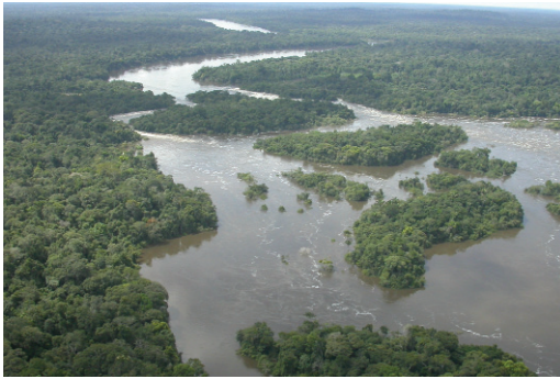
Aerial view of the rio Roosevelt and terra firme forest at Pousada Rio Roosevelt, Amazonas, Brazil

some white water enters seasonally, especially into the rio Maderinha). Microhabitats sampled included: dense vine tangles, which are common due to the distinct dry season (especially along forested igarapés [streams]); second growth (by the airstrip); areas of boulders with deciduous forest; sandy-belt campina forest; a seasonally flooded black-water lake; and, on the right bank, small areas of bamboo