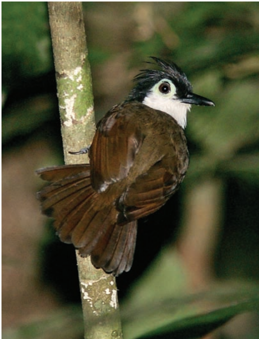
Figure 4. White-breasted Antbird Rhegmatorhina hoffmanni (Edson Endrigo)