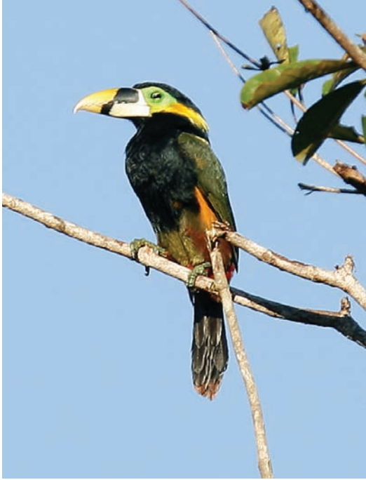
Figure 2. Gould's Toucanet Selenidera gouldii (Edson Endrigo)