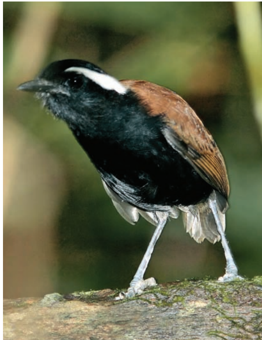
Figure 5. Black-bellied Gnateater Conopophaga melanogaster (Edson Endrigo)