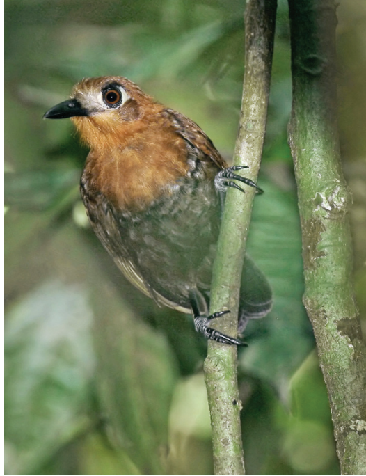
Figure 3. Pale-faced Antbird Skutchia borbae (Edson Endrigo)